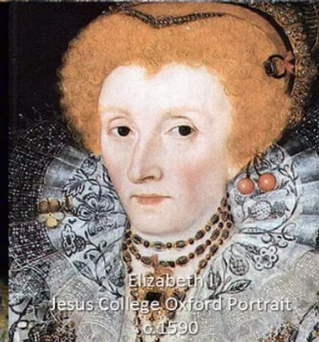
Elizabeth I Jesus College Oxford Portrait c. 1590