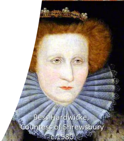
Bess Hardwicke, Countess of Shrewsbury c. 1580