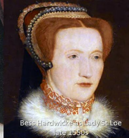
Bess Hardwicke as Lady St Loe late 1550s