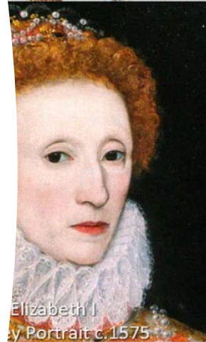
Elizabeth I by Portrait c. 1575