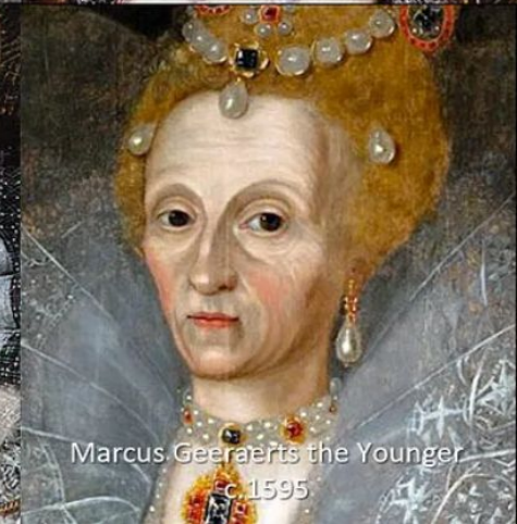
Marcus Geeraerts the Younger c. 1595