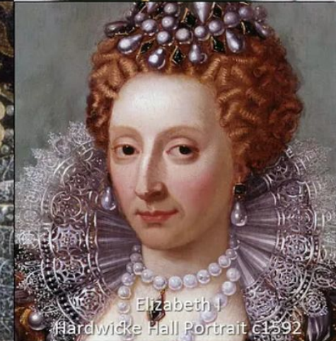
Elizabeth I Hardwicke Hall Portrait c. 1592