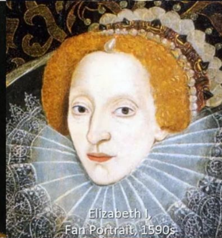
Elizabeth I Fan Portrait, 1590s