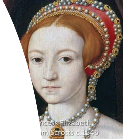
Princess Elizabeth by Simon Scrots c. 1546

There are several questions in each exam paper, with a combination of short form and long form answers, with the long form answers provided the majority of the marks