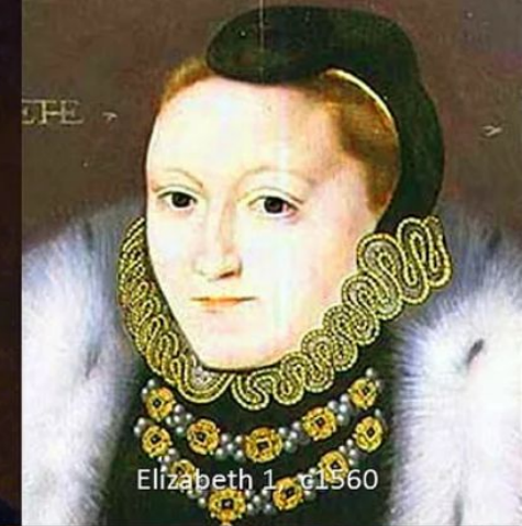
Elizabeth I c. 1560